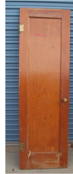
Door 3 Wooden door 24" x 77.5" (door size) From 401 E. Geneseo St.