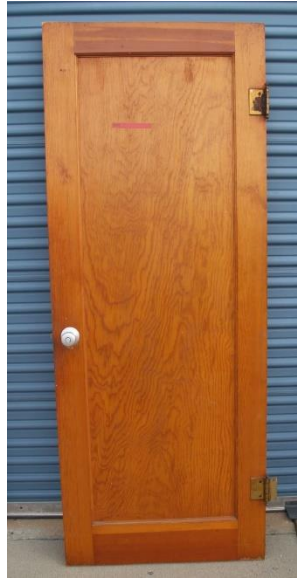
Door 2 Wooden door 30" x 77.5" (door size) From 401 E. Geneseo St.