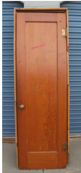
Door 4 Wooden door, including jamb 24" x 78.5" (door size) From 401 E. Geneseo St.