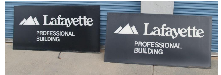
Signs From Lafayette Professional Building From 100 W. Cleveland St.