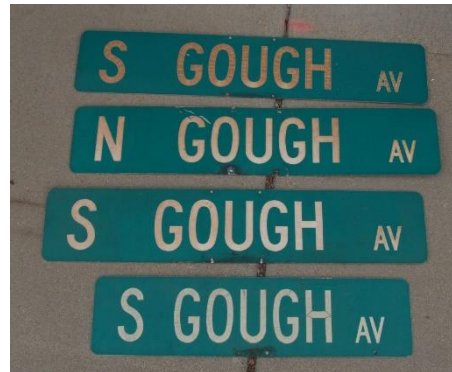
Street Signs Removed from Gough Ave. during brief renaming to Couch Ave. From N. and S. Gough Ave.