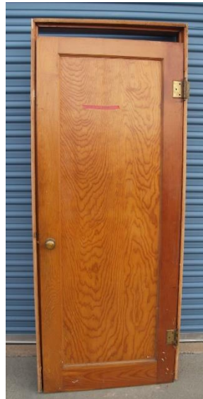
Door 5 Wooden door, including jamb 30" x 76" (door size) From 401 E. Geneseo St.