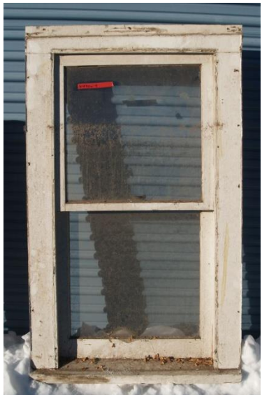
Window 4 Double hung window 25.5" x 49" (window frame size, not opening size) From 401 E. Geneseo St.