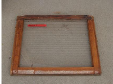
Window 1 Sash for double hung window 24" x 19" From 401 E. Geneseo St. or 305-307 E. Simpson St.