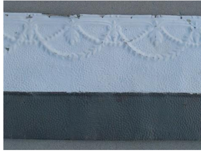
Tin Ceiling Style 4 Embossed tin ceiling, flat pieces, curve pattern 9 pieces 3' x 17" From 305-307 E. Simpson St.