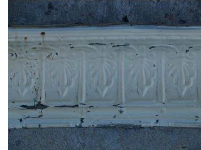
Tin Ceiling Style 5 Embossed tin ceiling, cornice pieces, ornate pattern 7 pieces 4' x 8" 2 pieces 1' x 8" From 305-307 E. Simpson St.