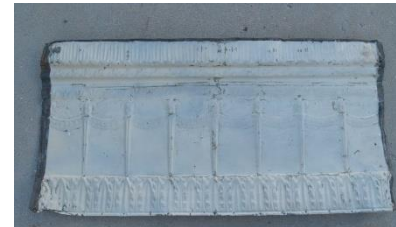
Tin Ceiling Style 7 Embossed tin ceiling, flat pieces, ornate pattern 1 piece 2' x 4' edge piece 1 piece 2' x 2' corner piece From 305-307 E. Simpson St.