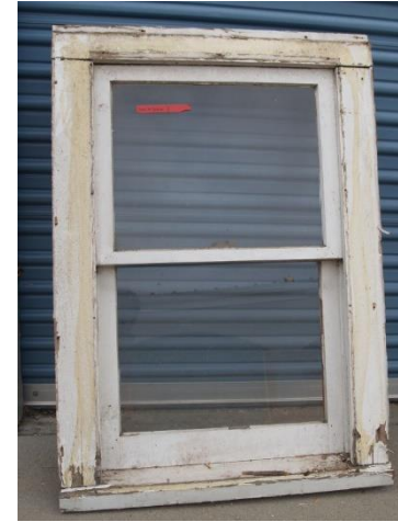
Window 3 Double hung window 25.5" x 40.5" (window frame size, not opening size) From 401 E. Geneseo St.