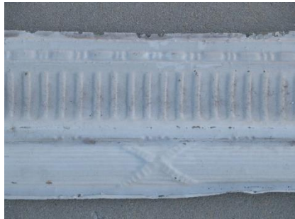
Tin Ceiling Style 6 Embossed tin ceiling, cornice pieces, striped pattern 16 pieces 1' x 4' From 305-307 E. Simpson St.