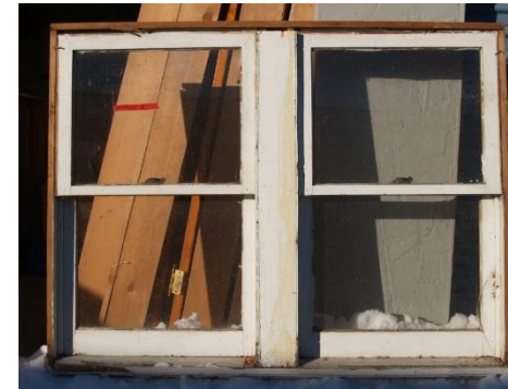
Window 6 Double hung window Window frame width is 53.5". Interior side of frame is 38.5" tall, exterior side of frame is 41" tall (window sill is tilted for drainage). From 401 E. Geneseo St.