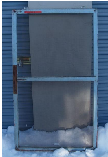
Window Screen 2 32" x 54" From 305-307 E. Simpson St.