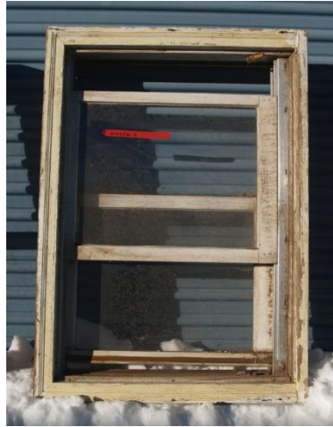
Window 7 Double hung window, retrofitted with new slider hardware 29" x 37.5" From 401 E. Geneseo St.