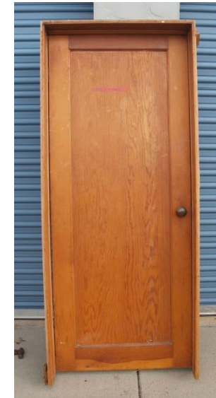
Door 6 Wooden door, including jamb 30" x 73" (door size) From 401 E. Geneseo St.