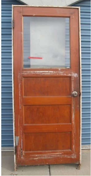
Door 1 Wooden door with window, including jamb 32" x 78" (door size) From 401 E. Geneseo St.