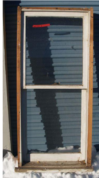
Window 8 Double hung window, retrofitted with new slider hardware 26" x 57.5" From 401 E. Geneseo St.