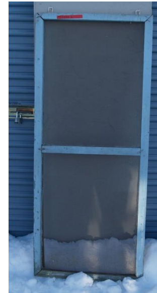
Window Screen 1 24" x 57" From 305-307 E. Simpson St.