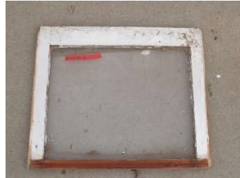
Window 2 Sash for double hung window 24" x 20" From 401 E. Geneseo St. or 305-307 E. Simpson St.